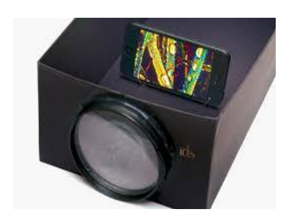
Stay Home and watch a movie

<u>Build</u> a projector for your smart phone.