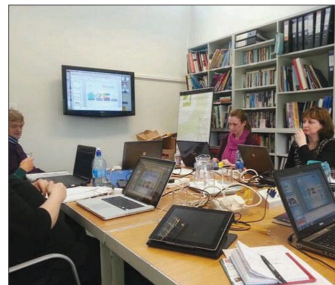
Finalising our first CPD day on Level 2 Learning Programmes in Laois Education Centre recently.

The JCT L2LP Team is finalising the design of a first CPD day to be offered to teachers shortly. This day will give an overview of L2LPs, for example what they look like, terminology and getting started. Subsequent CPD days will address topics such as planning, assessment, gathering evidence and moderation.