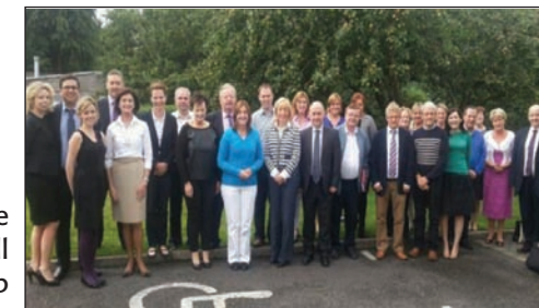
Inaugural meeting of JCT Leadership Associates and English Team: Sept. 2013

JCT's plan outlines a model of two core national workshops per annum for all school leaders. Our second workshop for all school leaders will be available later in this school year.