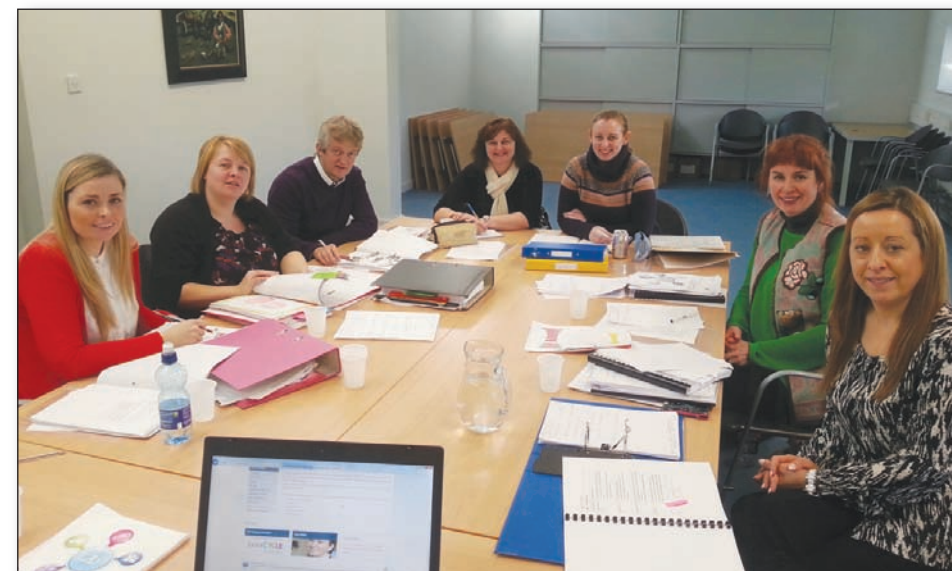
Our L2LP CPD Design Team at work in Portlaoise Education Centre recently. CPD on L2LPs will be offered shortly.

You will hear all about CPD for the new Junior Cycle first on Twitter. Why not follow us on @JCFforTeachers