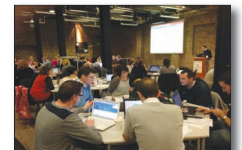
Teachers from EUFolio pilot schools training in the Digital Hub Dublin in January 2014.