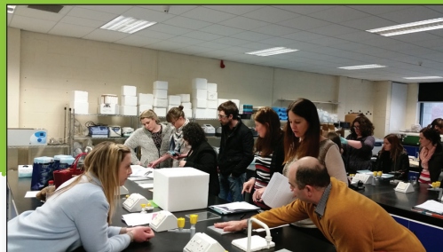
JCT Science Team engaging in some scientific enquiry at Amgen Teach in DCU.

Our Science section of the JCT website has been populated with initial resources to support student learning in Science classrooms. There are dedicated pages for each of the contextual strands and the Nature of Science from the specification, as well as a page for methodological supports. JCT will continue to upload new and engaging supports for teachers and students to the website over time and we will liaise with teachers to discuss their resource needs. Teachers can also access recent news, events and information on core and elective CPD opportunities on our website. The JCT Science Team is actively looking at various ways to support Science teachers in the online space. More exciting updates to follow on our new website www.jct.ie