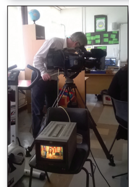
Left: Matt Kelly Productions filming L2LPs in Special Schools for JCT.