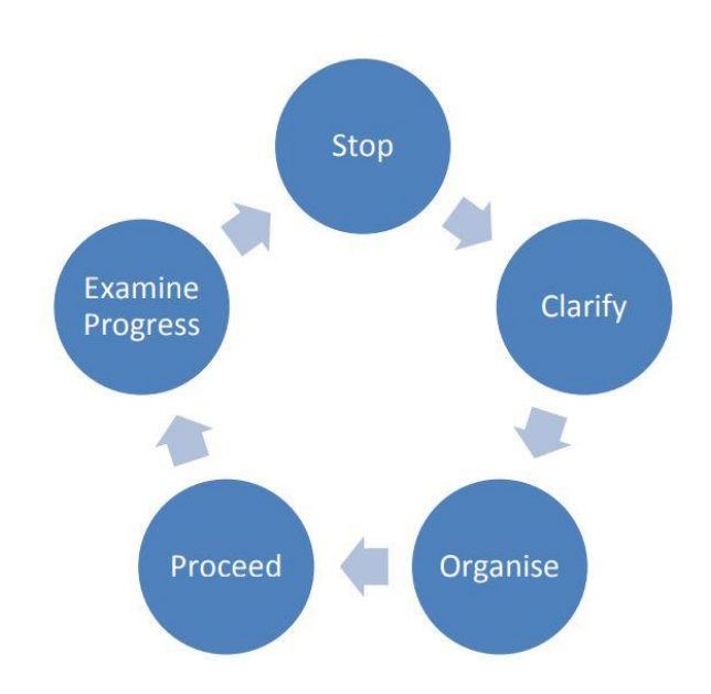
STOP - CLARIFY - ORGANISE - PROCEED - EXAMINE

Stop- mentally pause, take a moment to think, to avoid making a reflex, emotional response.